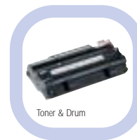
Toner & Drum